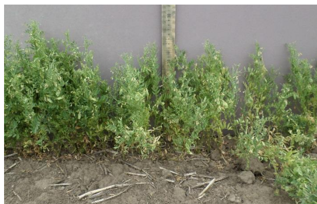
Single row planting of a lentil accession in the lentil core collection from the Washington State University germplasm repository at Pullman, WA. Plants are at physiological maturity. Stephen Guy, Washington State University

A growing season of 80 to 100 days is required for growing a lentil crop, depending on seeding date, precipitation and heat units (Cash et al., 2001). Lentil seed pods mature from the bottom up, with the lower pods maturing before the upper pods. The crop should be swathed or desiccated with chemical desiccants when the lower pods mature to prevent seed shattering (Cash et al., 2001). The crop can also be direct combined, which reduces losses due to shattering and weather delays. Combine headers with automatic height adjustment (“flex” headers) and “pick up” reel attachments are helpful. Low cylinder speeds (less than 500 rpm) should be used to minimize damage to the seed. Lentils should have about 18 to 20% moisture at the time of harvest to prevent seed damage (Oplinger et al., 1990), then dried to 14 to 15% moisture for long-term storage (Oplinger et al., 1990; Cash et al., 2001).