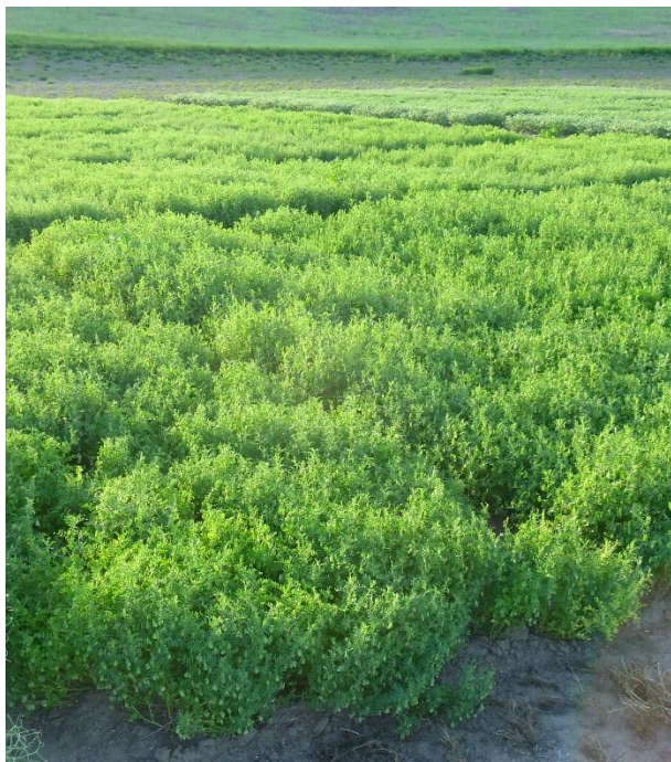
Lentils in a variety trial near Dusty, WA in early July at the end of flowering during pod filling. Stephen Guy, Washington State University

Livestock feed: Lentils that do not meet food grade standards (#3 or below) are used for livestock feed (Oplinger et al., 1990). Plant residues are also sometimes fed to livestock.