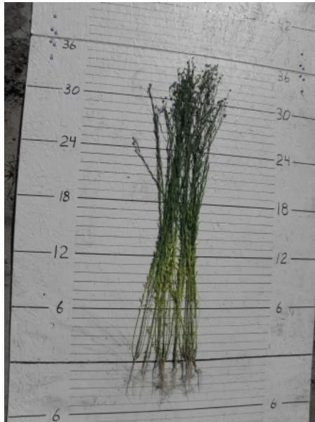
62 days following planting, 8/26/2013