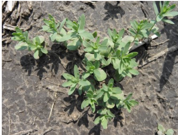
15 days following planting, 7/10/2013