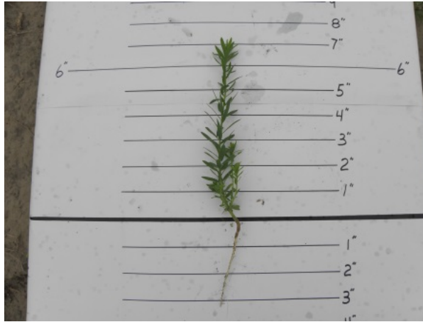
30 days following planting, 7/25/2013