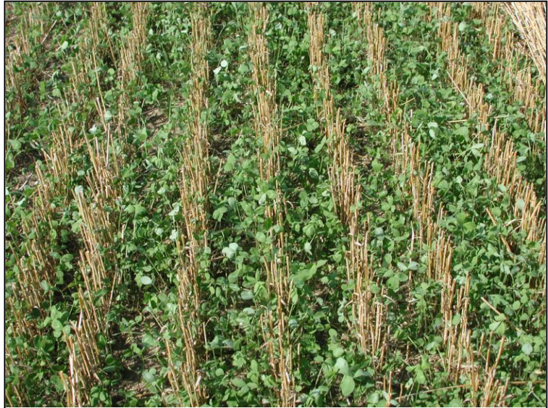
A red clover stand that was frost seeded into wheat.

Michigan's three common red clover cultivars are Michigan mammoth, Canadian mammoth (also known as Altaswede clover) and June (also known as medium red clover). Choose a cultivar based on how the seeding will be used. Canadian-grown mammoth clover does not tolerate the increased shading and competition from well fertilized wheat, but works well when seeded with oats. Michigan mammoth and June clover have been shown to perform better when frost seeded into well fertilized wheat fields.