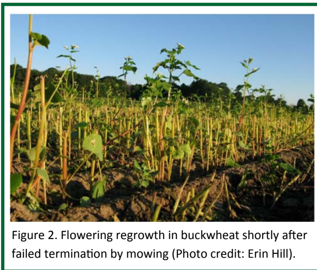
Figure 2. Flowering regrowth in buckwheat shortly after failed termination by mowing.

In systems that include tillage, or are managed organically, mechanical soil disturbance can be a reliable method of cover crop termination. A moldboard plow is the most effective tool to manage dense stands of overwintering cover crops. Chisel plowing is also an effective method for termination of most cover crops. However, multiple passes may be required if large amounts of cover crop biomass are present. Rototillers can also terminate cover crops when biomass levels are low enough to avoid clogging. Vertical tillage tools are not reliable for cover crop termination. Mowing is also not a reliable method of terminating most cover crops (Figure 2).