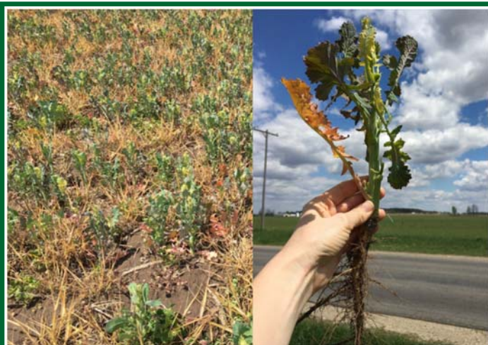
Figure 4 Glyphosate terminated the cereal rye (left), but failed to control bolting rapeseed (right) in this two-species mixture (Photo credit: Erin Hill).

Termination prior to flowering. Plants that have started to flower (reached the reproductive stage) may be difficult to control as the movement of photosynthates change in the plant, thereby altering the movement of herbicides that are translocated (Figure 4).