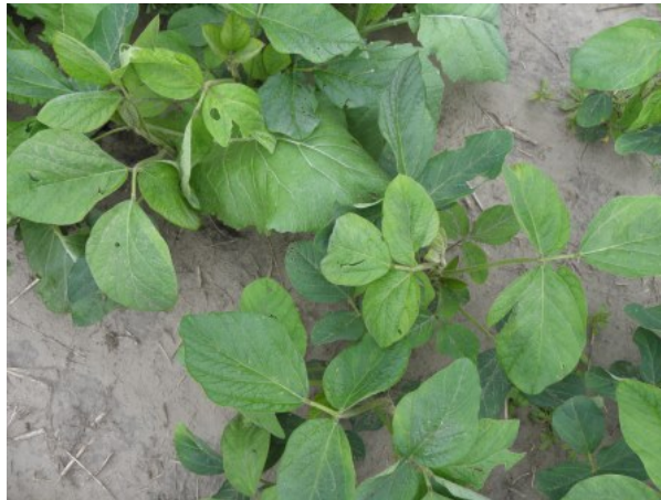
30 days following planting, 7/25/2013