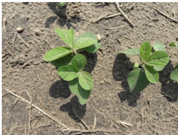
15 days following planting, 7/10/2013