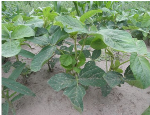
30 days following planting, 7/25/2013