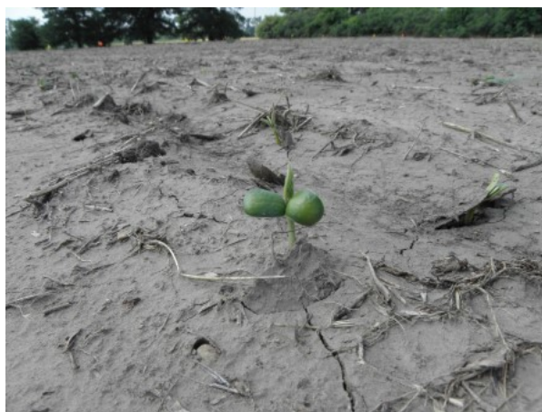
6 days following planting, 7/1/2013