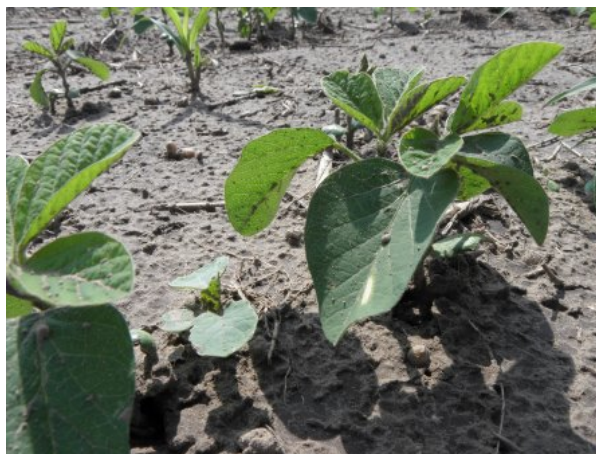
15 days following planting, 7/10/2013