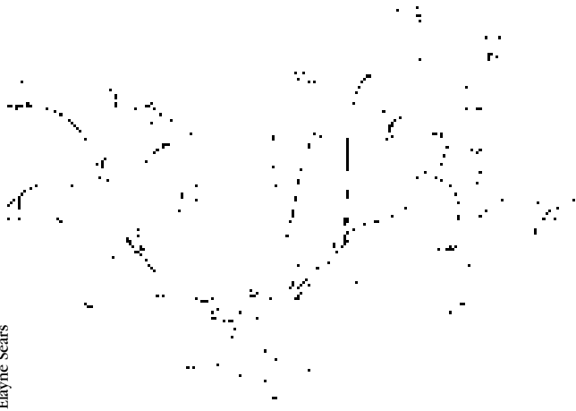
SUBTERRANEAN CLOVER ( Trifolium subterraneum )

over winter while living subclover prevented N loss (128). Mowing was effective in controlling a living mulch of subclover in a two-year California trial with late-spring, direct-seeded sweet corn and lettuce. This held true where subclover stands were dense and weed pressure was low. Planting into the subclover mulch was difficult, but was done without no-till equipment (239).